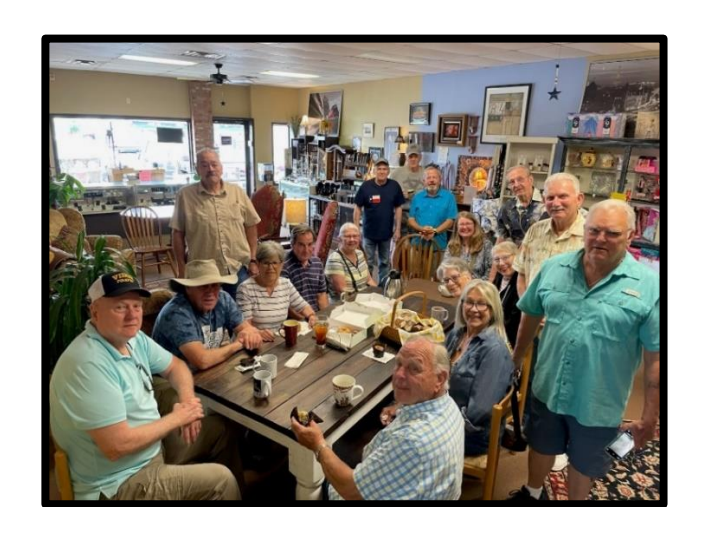
POTLUCK WITH A PURPOSE