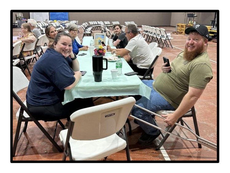
PRAYER QUILT MINISTRY