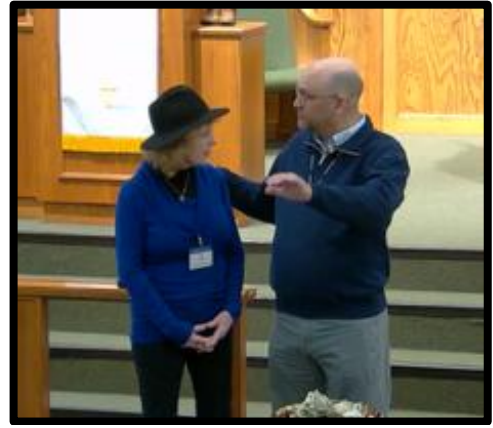
PRAYER QUILT MINISTRY