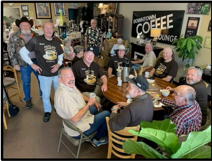
POTLUCK WITH A PURPOSE