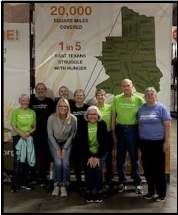
NEW MEMBERS OF BULLARD METHODIST CHURCH